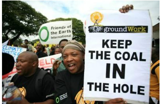
George Monbiot calculates that to have a decent chance of containing global warming to 2°C, we can only burn one third of conventional fossil fuel reserves at most, before 2050.

Friends of the Earth aims to support communities opposing extractive industries. As part of our 2012 programme, we plan to organise a series of talks around the country with our colleagues from Friends of the Earth International.