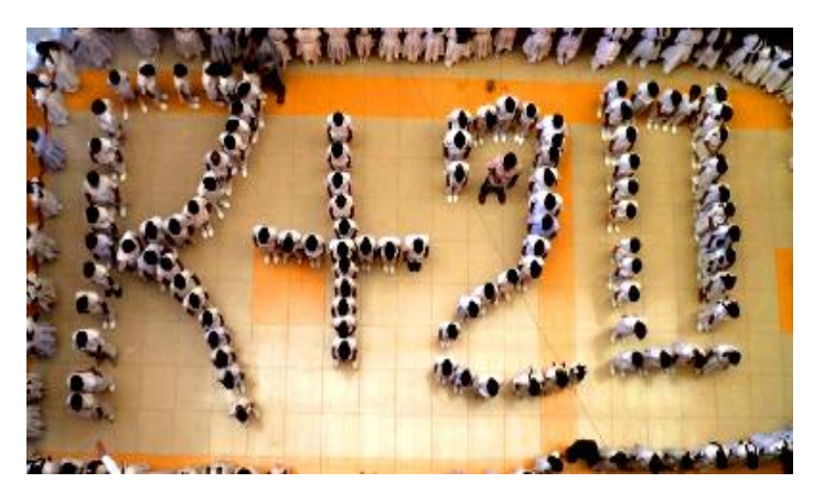
The first UN treaty on climate change was agreed in Rio de Janeiro in 1992. 20 years on, it's time to keep the promise to avoid dangerous climate change.

Two thirds of families in sub-Saharan Africa grow their own food to survive but climate change is already making droughts longer and more frequent, putting the livelihoods of these family farmers at grave risk