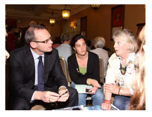
Constituents press Simon Coveney at the Stop Climate Chaos mass lobby in 2010.