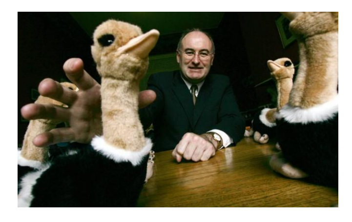
Phil Hogan says he wants to hear from you. Better make it quick.

The Government is holding a public consultation on climate policy ahead of drafting the climate Bill. Friends of the Earth supporters have actively participated in previous public consultations and we know it makes a real difference to the outcome. This time it's more important than ever that your views are represented. The Minister has said he wants the consultation to be inclusive and we'll be encouraging as many people as possible to take part.